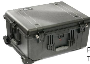
Pelican 1610 Transit Case

While Rugged Portable Computers LLC uses reasonable effort to ensure that this information is accurate and up-to-date, the information may contain factual or typographical errors. Rugged Portable Computers LLC makes no warranties or representation as to the accuracy of such information. The information and products may be changed at any time without prior notification or obligation. Rugged Portable Computers LLC © Copyright 2017.